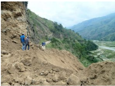
Spinning Eyes Road Construction

Here is what I went through during my week of visiting 6 churches in the deep end of Haiti. First the road to many of our churches is rough. It takes special courage to risk one's life on those roads. Some of the places have