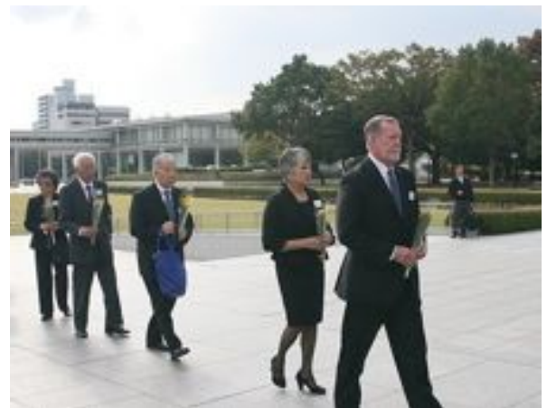
Delegation brought flowers to the Hiroshima Peace Park Cenotaph to pay respect to victims of the A-Bomb.