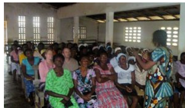
Ladies of Baptiste

went women were the majority in churches and very active. In two churches they have very active sewing centers and one grinding machine for rice and another machine for maze. I saw how the teaching of micro finances is producing fruits. Beside, they always do evangelism in their communities.