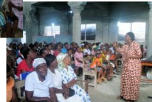
Ladies of Belladere

All the women wished to have such visits on a regular basis. Because of your commitment I can say: "Here I am Lord, send me".