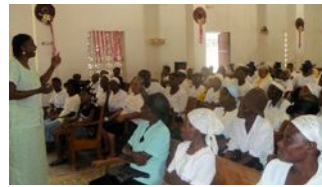
Ladies of Lascaobas

After seeing where our ladies come from to attend our meetings and trainings, I have come to respect them more. They endure a great deal of sacrifices and risk their lives on the most dangerous roads I have seen in this country in fourteen years of ministries. The visit also showed how much women were excited, interested and involved in the Lord's work. Everywhere I