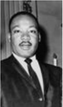
Rev. Dr. Martin L. King, Jr.

You, your family and friends are invited to come together