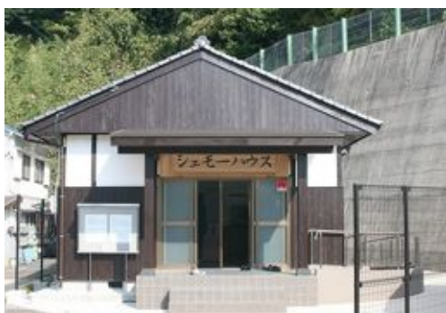
The Schmoe House, Naka-ku, Hiroshima, Japan Built in 1951