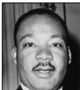
Rev. Dr. Martin L. King, Jr.

Dr. King's message of nonviolence and civil rights for all people is worth remembering—and even more