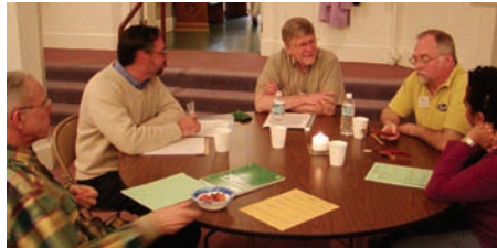
Pastors in Group Discussion