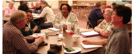
A Group in Discussion