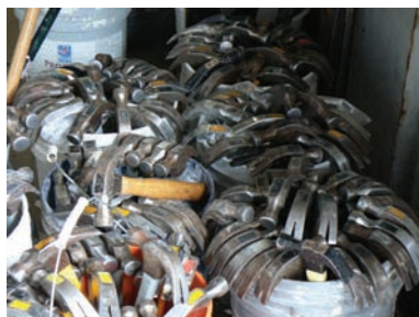
So how many hammers do you think it takes to build 12 houses in 2 weeks?

was so excited that she would have this place for herself and her 5 grandchildren—that they would have a yard to play in—her