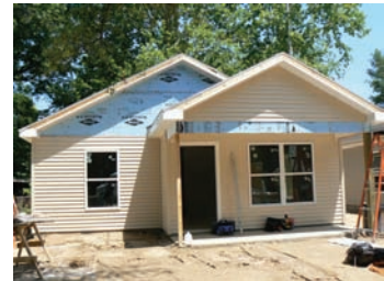
Home I worked on the day I left (6 days after start).