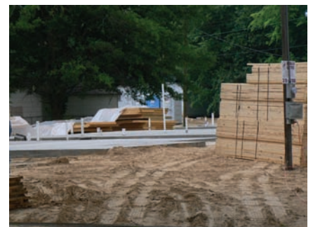
Home sites the first day.