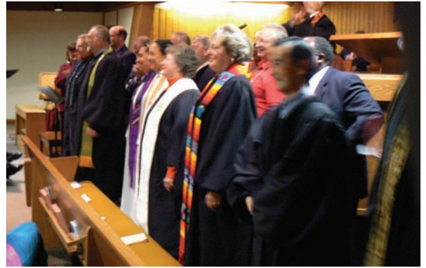
Those ordained (or recognized) by Evergreen in our 4 years together!