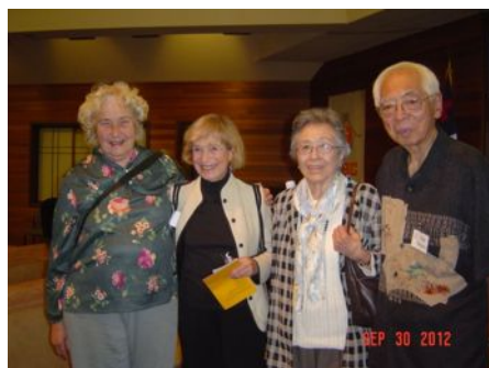
SEP 30 2012